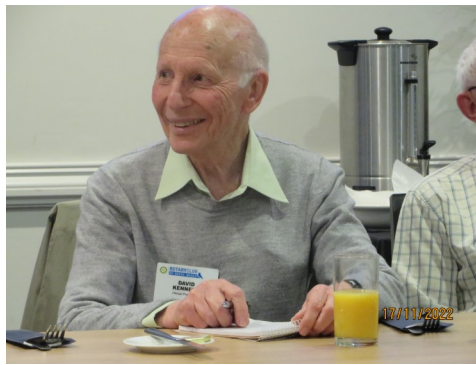
Our 'scribe' - dutifully recording the notes for this Bulletin.