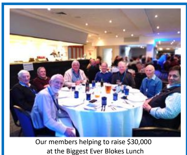
Our members helping to raise $30,000 at the Biggest Ever Blokes Lunch