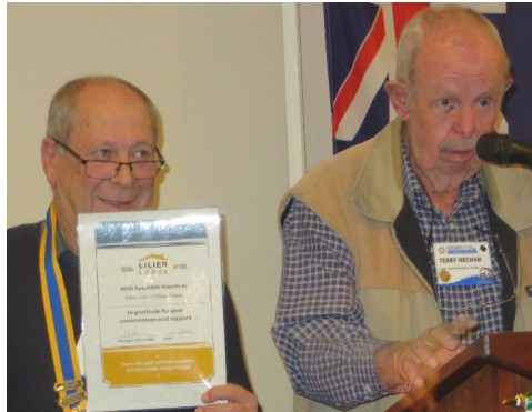
Presentation of the Lillier Lodge Certificate.