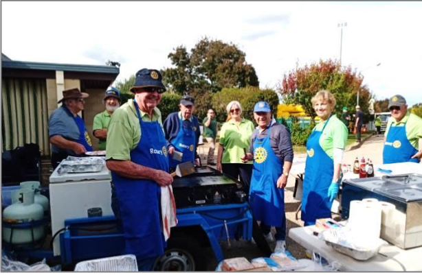
BBQ at the ProPatria Open Day

Pro Patria held an Open Day as a promotion and fund-raiser on Sunday 15 th April, and our club participated via a Barbeque. A huge crowd attended and our barbeque was staffed by a large group of Club members. The amount raised for Pro Patria will be learned at the next meeting.