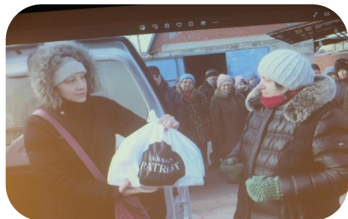
Supplies being distributed.