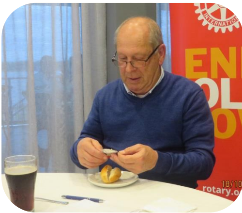
Contentment - Beer & a Bread Roll