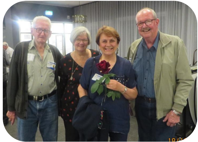
Spring! Roses among Thorns