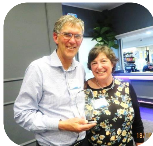
Winners are Grinners