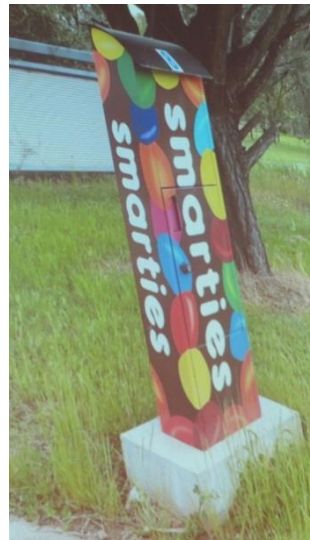
That smart letter box