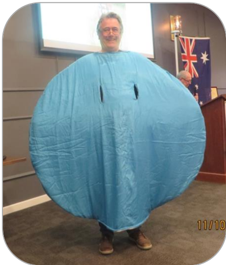
The blue smartie