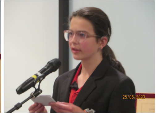
Representatives of The Sturt Public School Students who astounded us with their Speaking Skills.